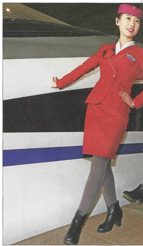
Ambitious new rail links signal an

world where there was a physical supply shortage." Instead, the price rise was due to "every pension fund in the world" knowing that the Federal Reserve wanted to devalue the dollar. They looked for a store of value to protect themselves. "That, of course, was oil... it's a large market, and it's priced in dollars... suddenly you've got financial players going into the market. What happens? Of course, the price rises and goes from $30 at the end of 2008 up to $120, because you can't print oil in the way that you print money."