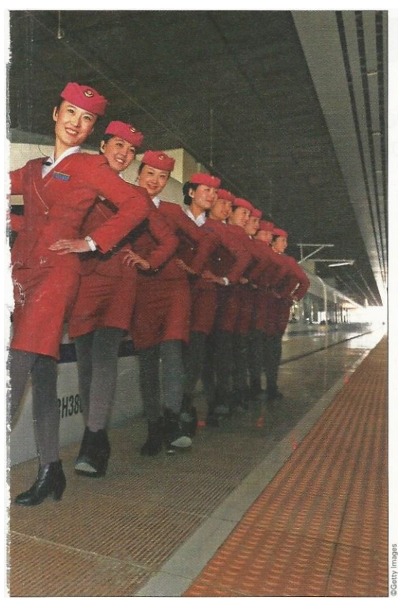
Important change of direction for China